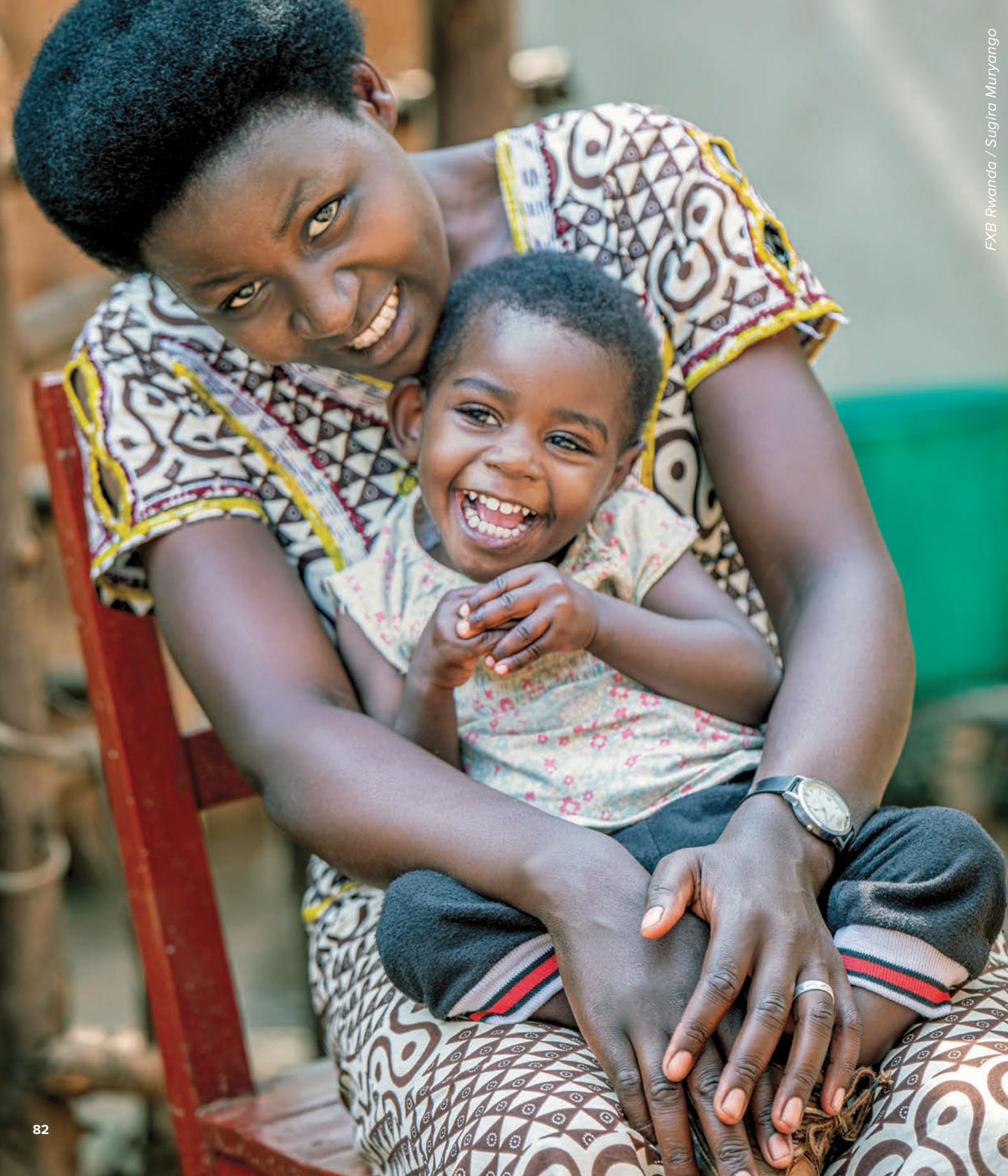
FXB Rwanda / Sugira Muryango