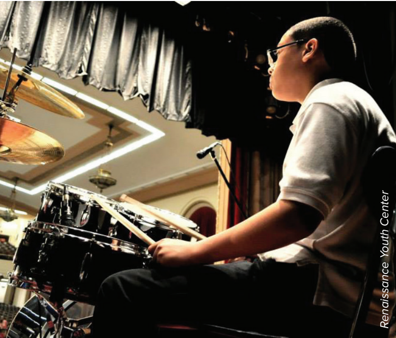
Renaissance Youth Center

Select investments contracted in 2021 & 2022