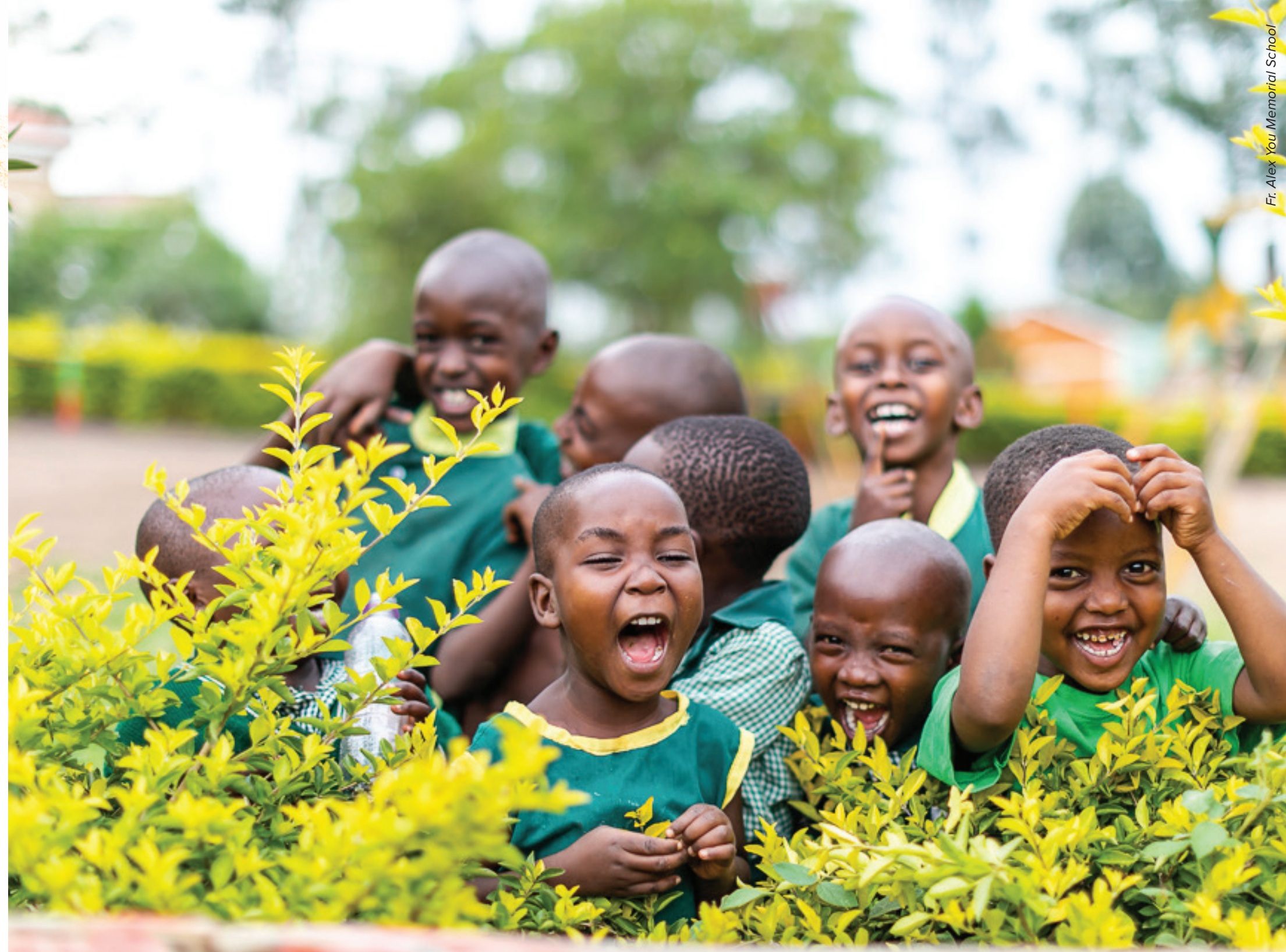
Fr. Alex You Memorial School

Launched in 2012, The ELMA Community Grants Program (ECGP) provides grantees with flexible funding as well as tailored capacity-strengthening in the areas of fundraising, financial management, leadership, measurement and evaluation, and program development.