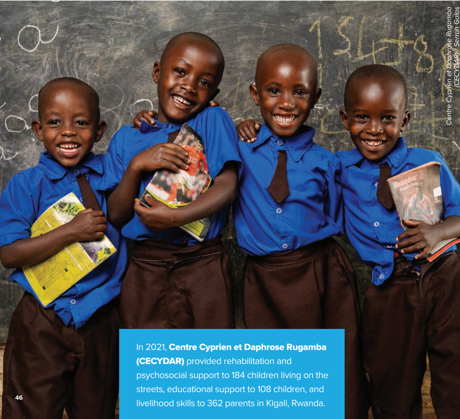
Centre Cyprien et Daphrose Rugamba (CECYDAR)

ChildSafe Equips parents, caregivers, service providers, and children to reduce preventable childhood injuries and accidents