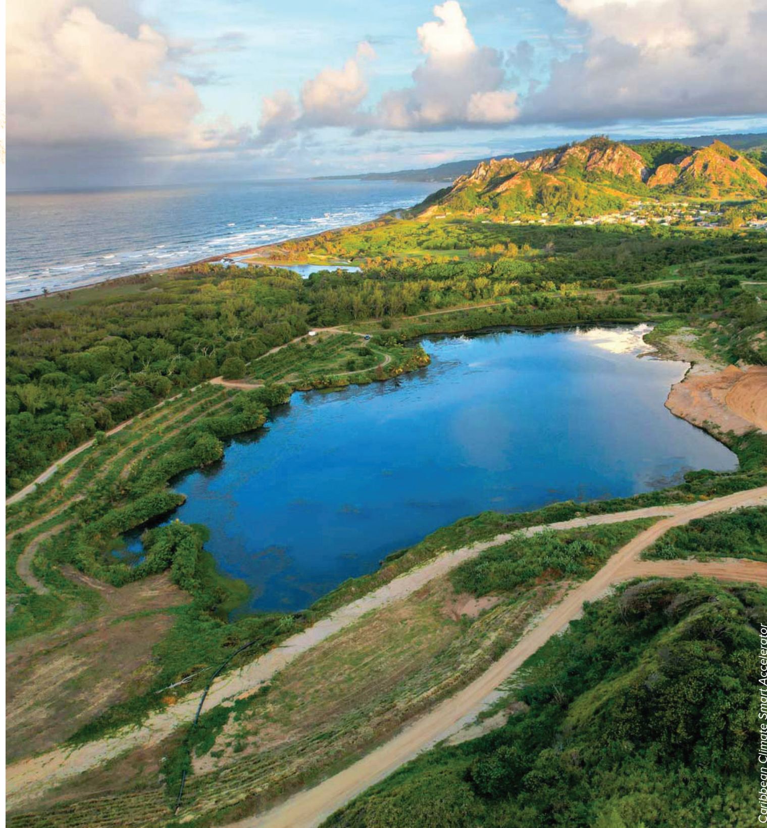
Caribbean Climate Smart Accelerator

invests in healthcare, climate resilience, and disaster response in the Caribbean