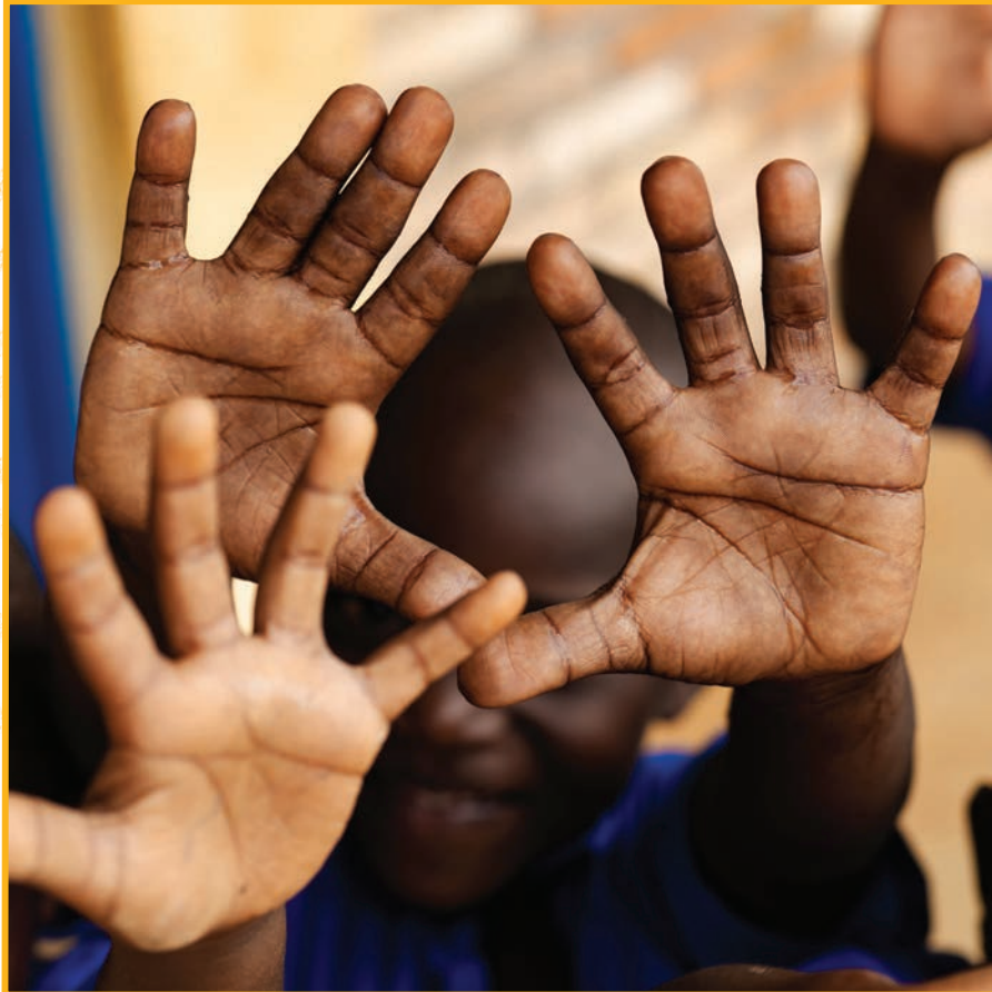
Centre Cyprien et Daphrose Rugamba (CECYDAR)