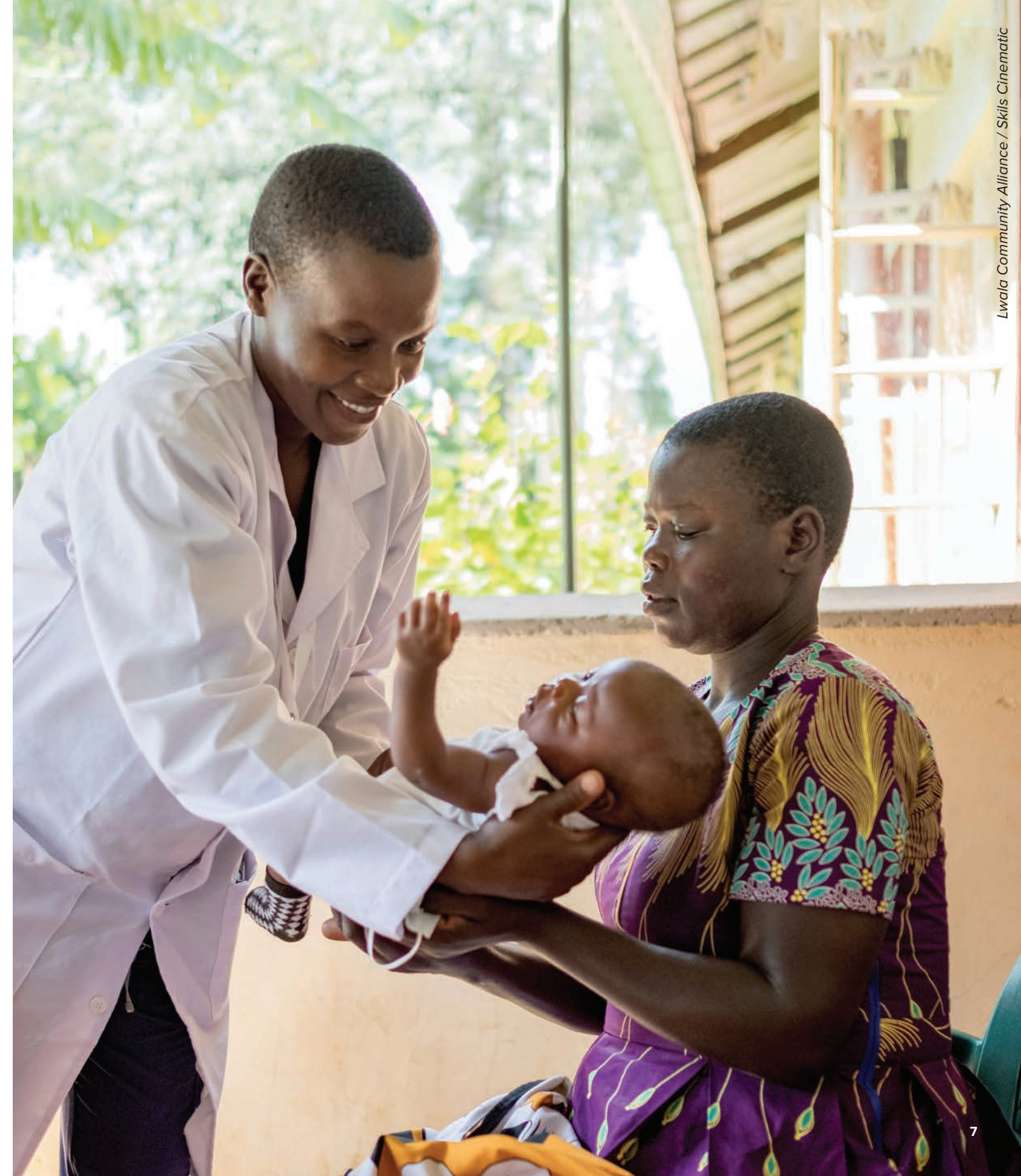
Lwala Community Alliance / Skills Cinematic