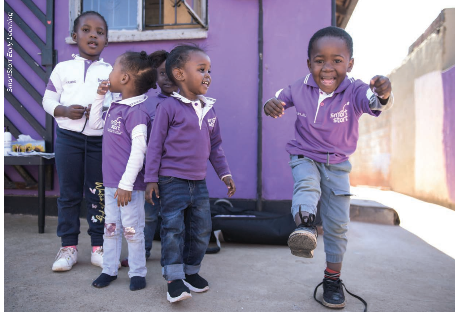
SmartStart Early Learning

ELMA supports a coalition of 12 early childhood partners in South Africa working to ensure approximately 1.8 million children ages 0-2 access an essential package of early childhood services, and approximately 2.1 million children access high-quality early education.