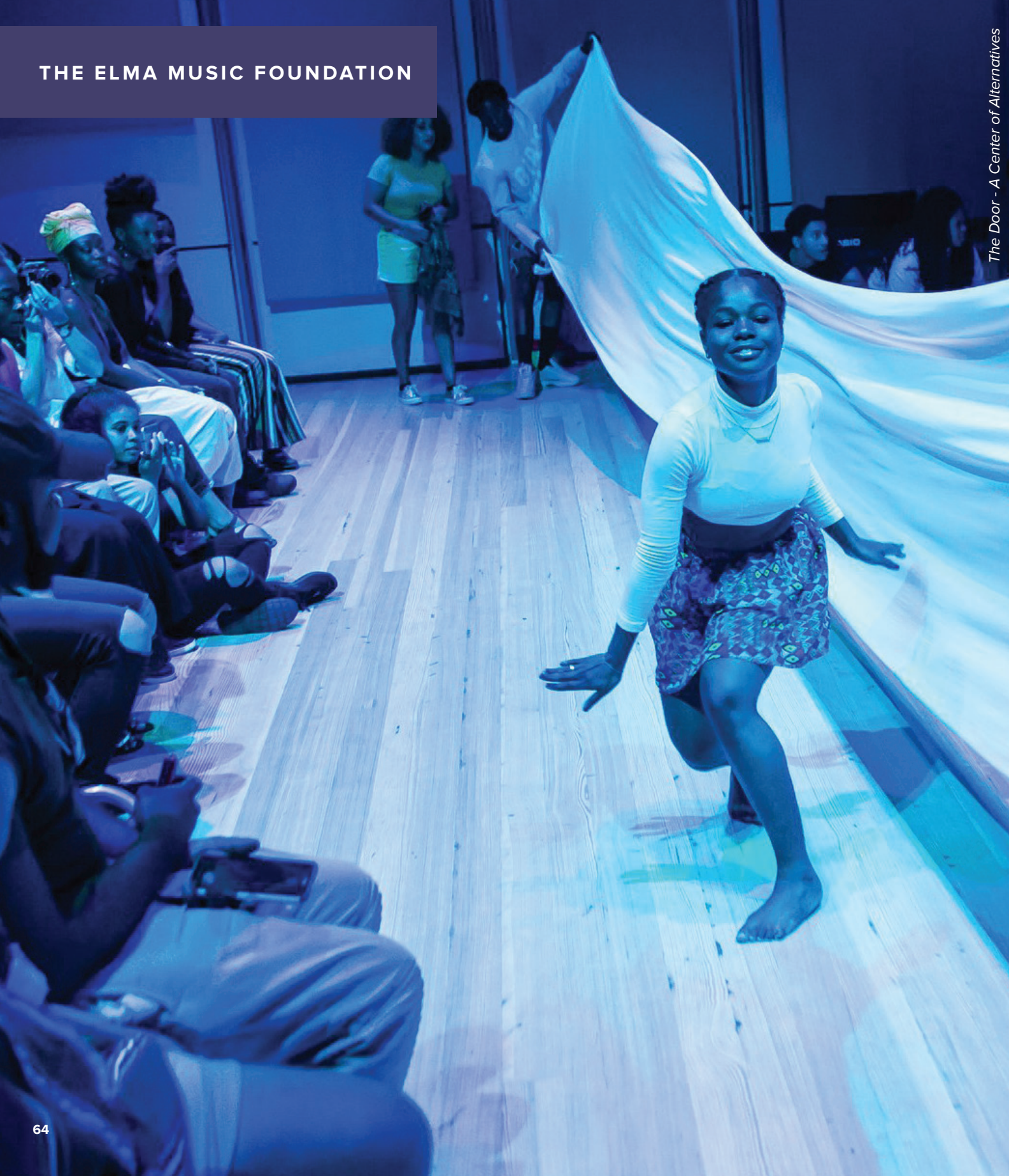
The Door - A Center of Alternatives