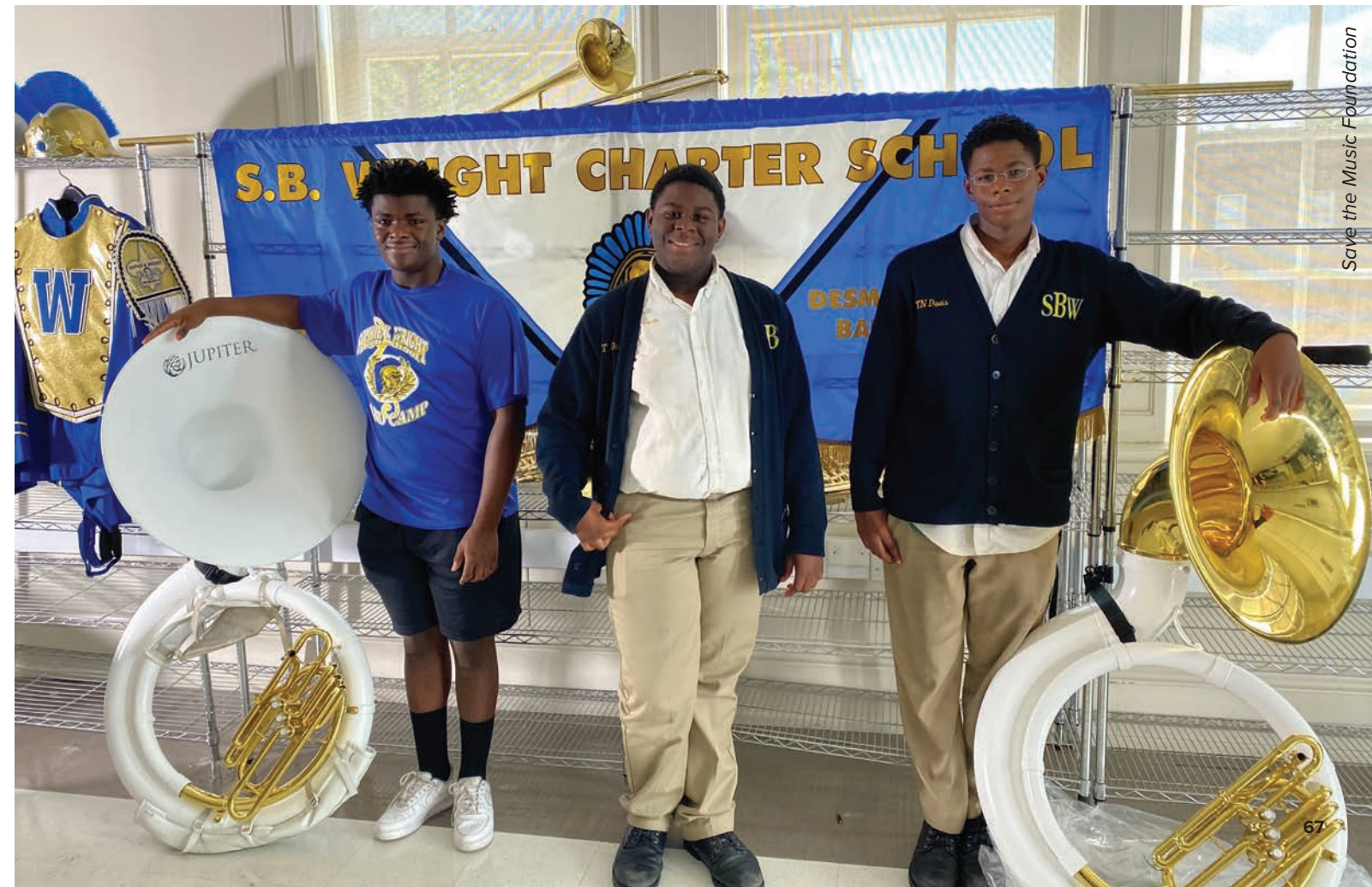
Save the Music Foundation

The MYDA coalition of community-based organizations includes: A Place Called Home, The Door - A Center of Alternatives, Guitars Over Guns, Mind Builders Creative Arts, Neutral Zone, Renaissance Youth Center, RYSE, Youth Empowerment Project, and Youth on Record