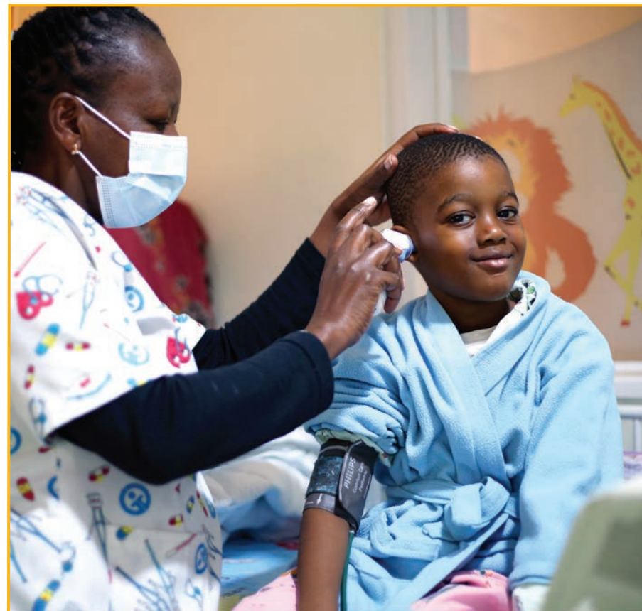
Front and inside covers: Pediatric nurses care for their young patients at Gertrude’s Children’s Hospital in Nairobi. The nursing school at Gertrude’s offers training programs in general pediatric and pediatric critical care nursing.

To date, KPFP has enrolled 124 pediatric nurses and 24 pediatricians in subspecialty training programs. As of September 2022, 44 (34.4%) fellows successfully completed their training and have been deployed to 38 hospitals across 32 counties in Kenya. The remaining fellows are on track to graduate by December 2023.