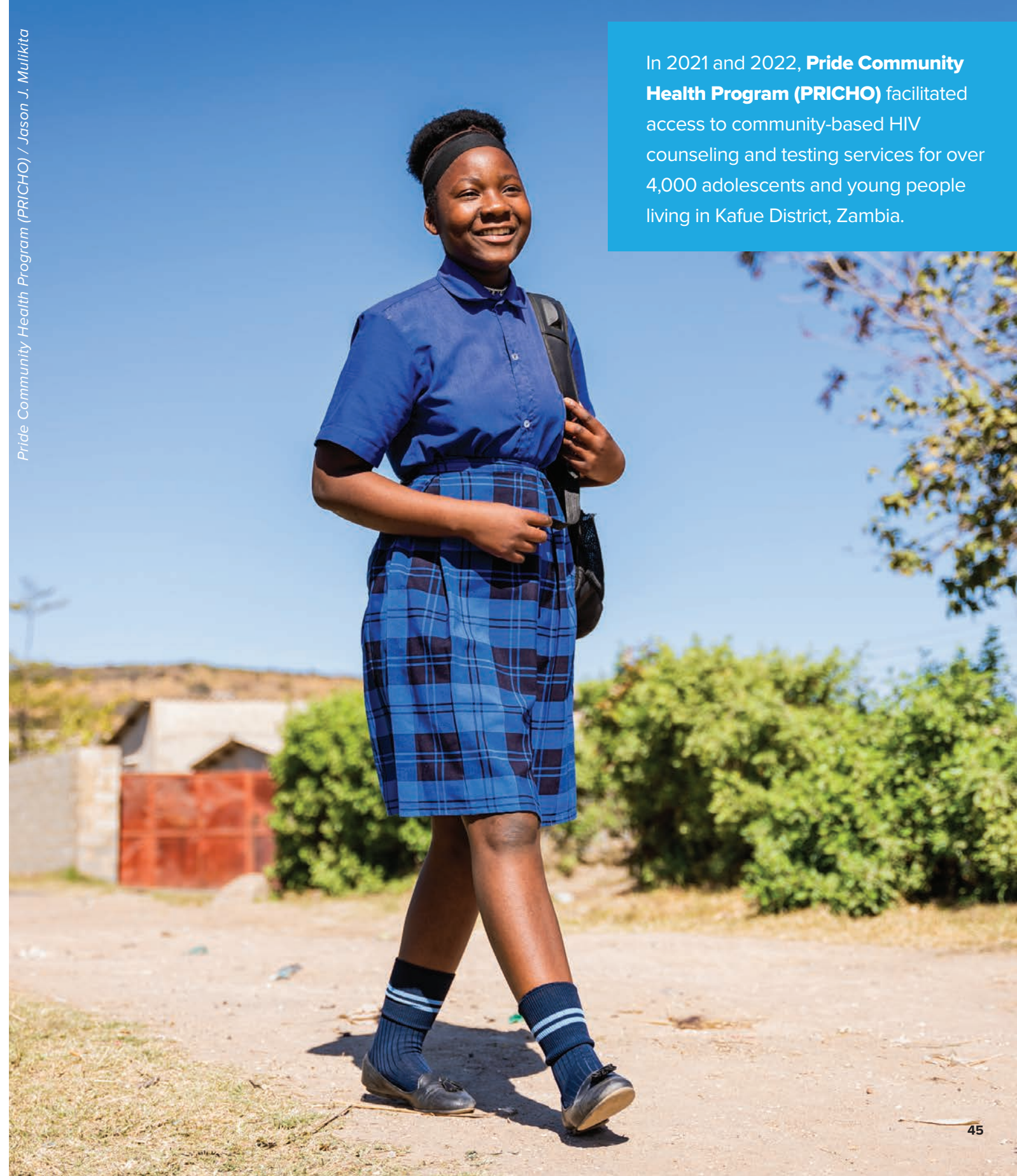
Pride Community Health Program (PRICHO)

In 2021 and 2022, Pride Community Health Program (PRICHO) facilitated access to community-based HIV counseling and testing services for over 4,000 adolescents and young people living in Kafue District, Zambia.