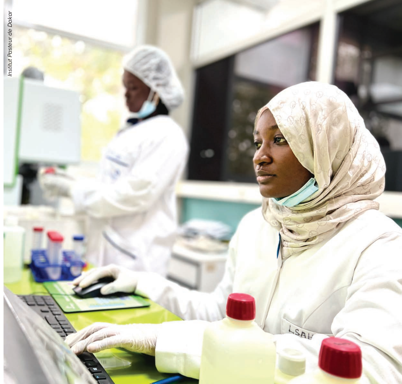
Institut Pasteur de Dakar

VillageReach Malawi Project support for COVID-19 vaccine rollout to reach 20% of Malawians by digitizing vaccine supply chain tools, training 8,000 vaccinators, and expanding a digital health communication platform